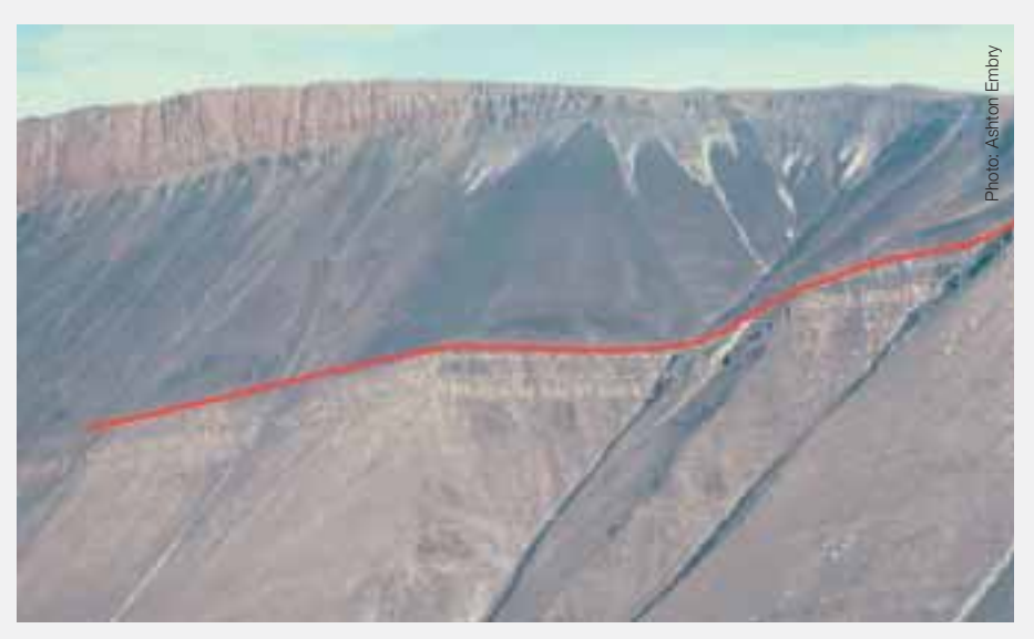
The top of the Lower Triassic sequence is marked by a prominent maximum regressive surface (red line) near the basin centre. The strata consist mainly of slope and outer shelf shale and siltstone with some thin outer shelf sandstone just below the boundary. Nansen Sound, northern Ellesmere Island

• The strata below the unconformities were often tilted and in some cases faulted