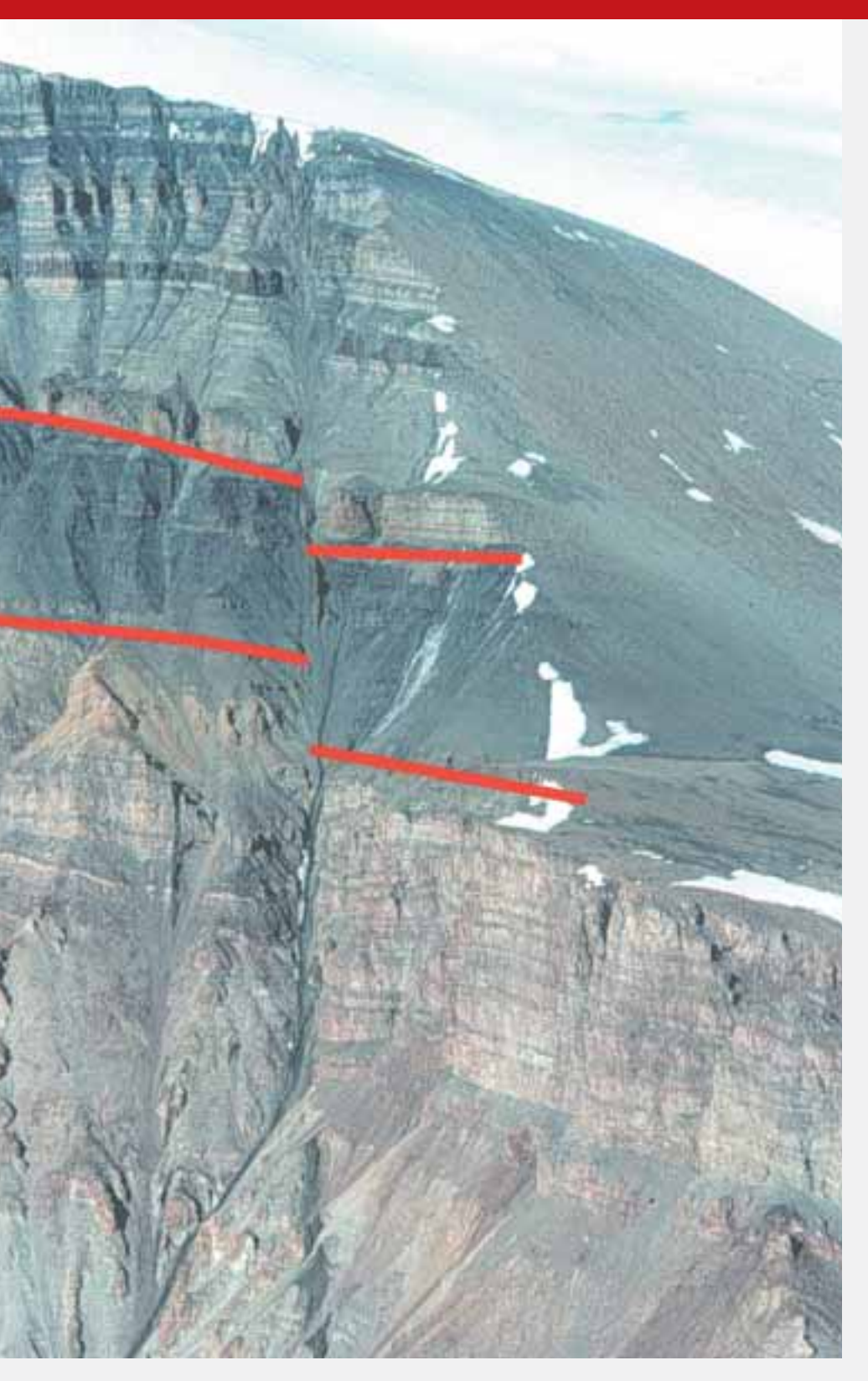
Two prominent unconformities are marked by the red lines. The lower one is an angular unconformity that places Upper Triassic shale (dark) on Carboniferous clastics and carbonates (light). Yelverton Pass, northern Ellesmere Island.