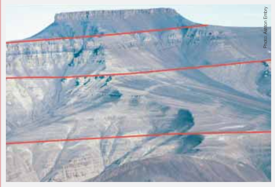
The red lines mark prominent maximum regressive surfaces within the Lower Triassic succession. These conformable surfaces form readily recognizable sequence boundaries well within the basin and correlate to unconformities on the basin flank. Otto Fiord, northern Ellesmere Island

unconformities. The Exxon eustatic model was accompanied by incredibly detailed and precisely dated sea level charts and it washed away any thoughts of global tectonism. The geological community, with the proviso that local tectonics "enhanced" unconformities in some cases, ecstatically embraced eustasy as the long sought key to global correlation.