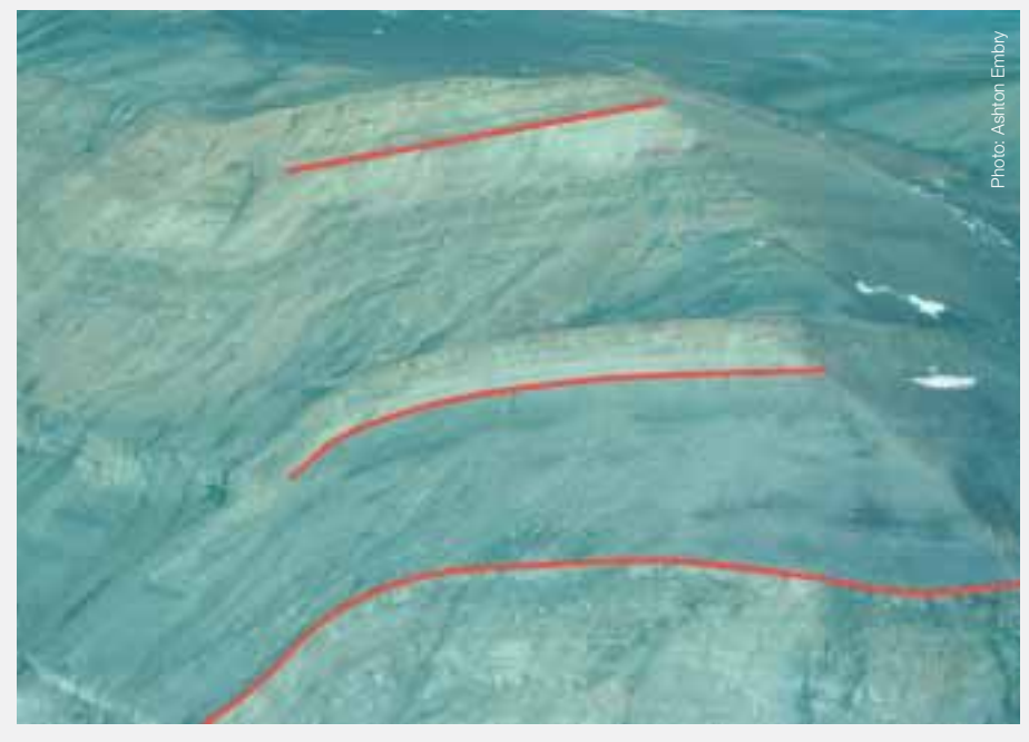
Three unconformities are marked by the red lines. The lower one puts Middle Triassic shales on Lower Triassic fluvial sandstones. The middle unconformity has Upper Triassic limestone on Middle Triassic shale. The upper one is within the Upper Triassic and at this locality about 200 m of strata have been removed at the unconformity. Greely Fiord, northern Ellesmere Island.

Ironically, when Sloss was proposing tectonic mechanisms to explain his observations, his former student, Peter Vail, along with his Exxon colleagues, revolutionized sequence stratigraphy with seismic sections and a eustasy-driven, deductive model of sequences and their bounding