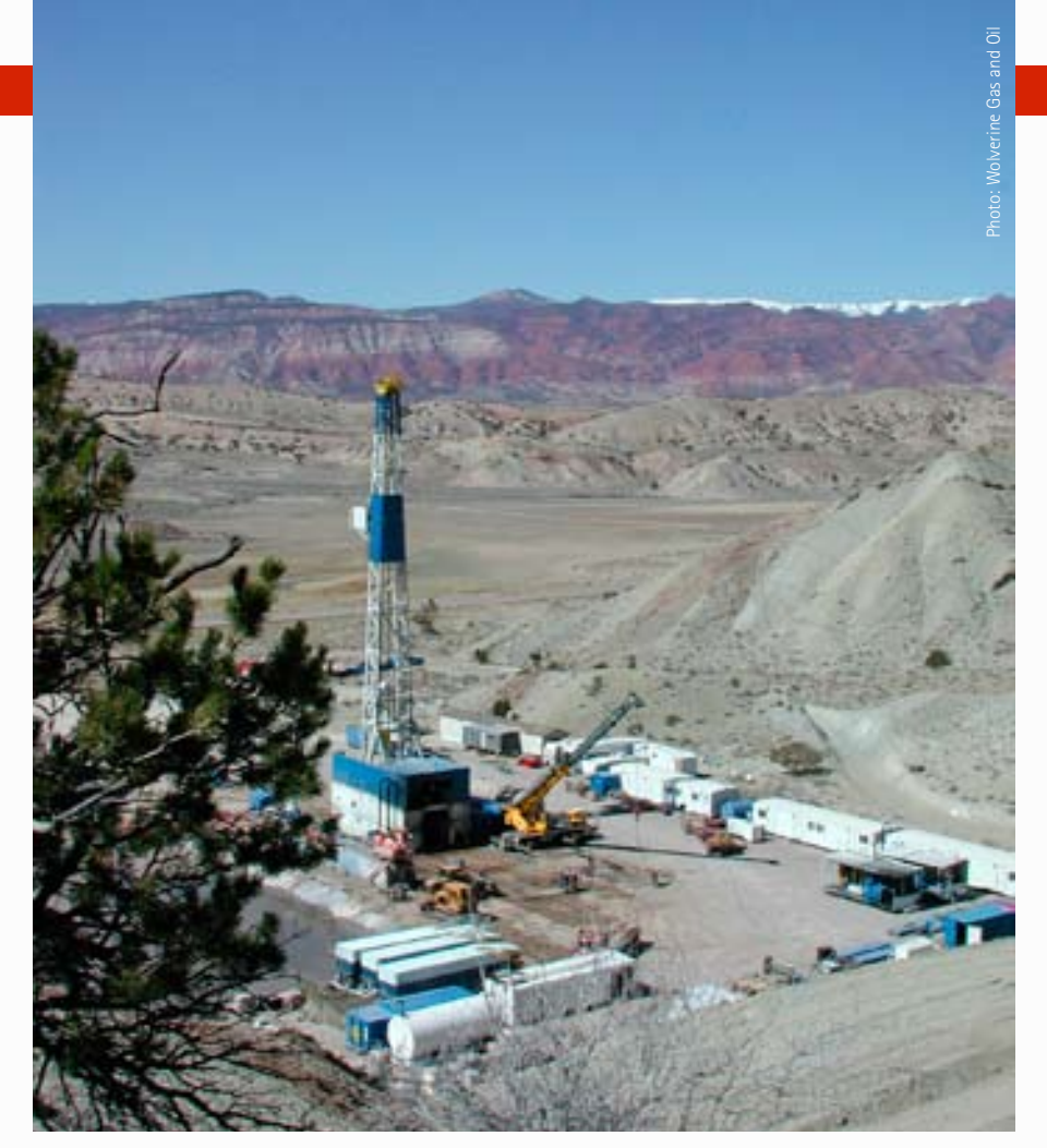
The discovery well, Wolverine's 17-1 Kings Meadow Ranch No. 1, encountered nearly 150 m of Navajo Sandstone pay trapped in an anticlinal fold associated with Cretaceous to Early Tertiary compressional deformation. The well flowed good quality, 40 gravity oil from 130 m of net pay with an average porosity of 12 percent and 100 mD of permeability. Currently, the field is producing 4,900 bopd from 10 wells.

in the near future. No data is currently available on these wells. He also said Wolverine has five to six additional exploration wells planned. In addition to drilling, they have acquired over 760 km of 2-D seismic data. Other companies are actively leasing with some leasing fees now over $1,000 an acre (4,000m<sup>2</sup>). Some of the other independents leasing in this area include Pioneer Oil and Gas, International Petroleum LLC, Armstrong Petroleum, Petro Hunt, and Craig Settle. In addition to the wells Wolverine has planned, nine more exploration wells are being permitted.