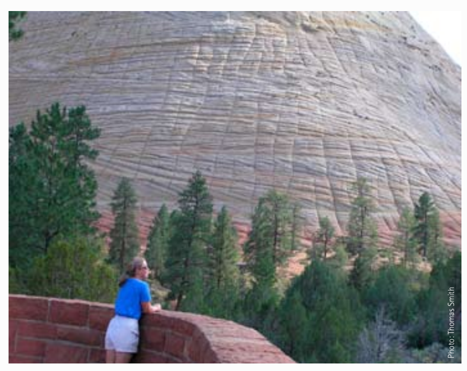
The Navaio Sandstone is an aeolian derived, quartzose and cross-bedded sandstone that forms the spectacular cliffs found in many of the national parks in Utah, as here in southern Utah's Zion National

additional wells will be drilled to develop the 650 hectare (6,5 km<sup>2</sup>) field but would not elaborate on total reserves. Other sources put reserves between 75 and 200 million barrels (12 and 32 million m3). Pinnell and Moulton, in a 2005 Oil and Gas Journal paper, estimate from Wolverine's own seismic structure map that 896 million bbl (142 million m³) may be recoverable.